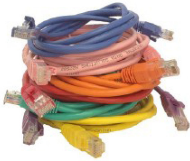
0.5m to 10m Cat 5E Patch Cable